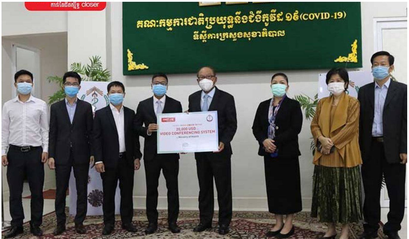
Metfone handing over the fund to MOH

For the past two months, the “Metfone’s Fighting Covid-19 Fund” has been completed and raised $50,000 to contribute to Cambodian Government and the people in their battle against the Covid 19 disease. This fund comes from the support of Metfone’s subscribers that Metfone donated 1,000 Riels whenever one customer download and use eMoney and Mocha App without any fee.