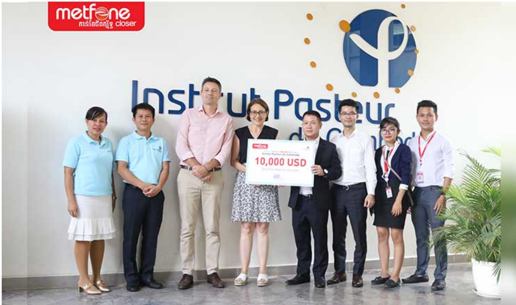
Metfone handing over the fund to Pasteur Institute of Cambodia

customers joining with no fee, come up with a donation of $50,000 United States from Metfone to Ministry of Health and other relevant authorities. Moreover, video conferencing system also provided to the Ministry of Health, in order to make remote communication and instructions with hospitals, health centers and its organ in nationwide more conveniently during this difficult situation.