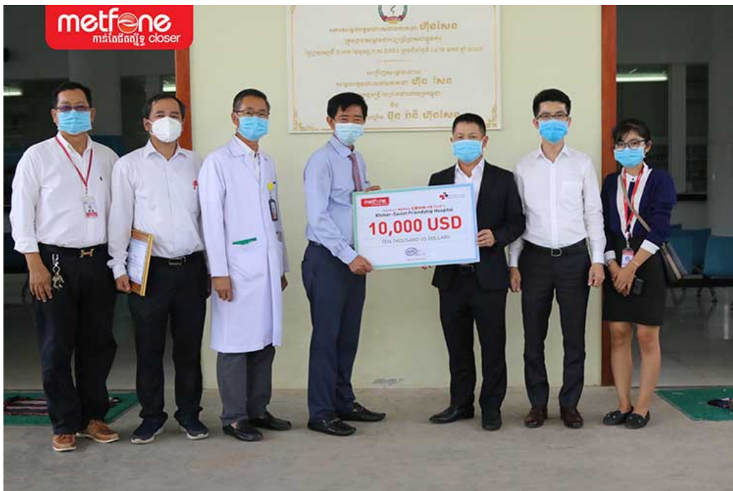
Metfone handing over the fund to Khmer Soviet hospital

“Metfone’s Fighting Covid-19 Fund” is totally no-fee program and everyone can donate to together ease this difficult situation. To join this program and start donation, customers simply just need to install and register Mocha application and/or eMoney application on Google play and Apple Store. Each of valid account will donate 1,000 Riel to the Fighting Covid-19 Fund,