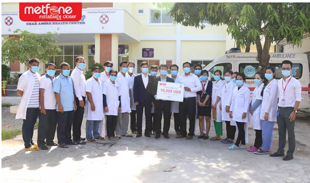
Metfone handing over the fund to Chak Angre Health Center

“Metfone’s Fighting Covid-19 Fund” is totally no-fee program and everyone can donate to together ease this difficult situation. To join this program and start donation, customers simply just need to install and register Mocha application and/or eMoney application on Google play and Apple Store. Each of valid account will donate 1,000 Riel to the Fighting Covid-19 Fund,