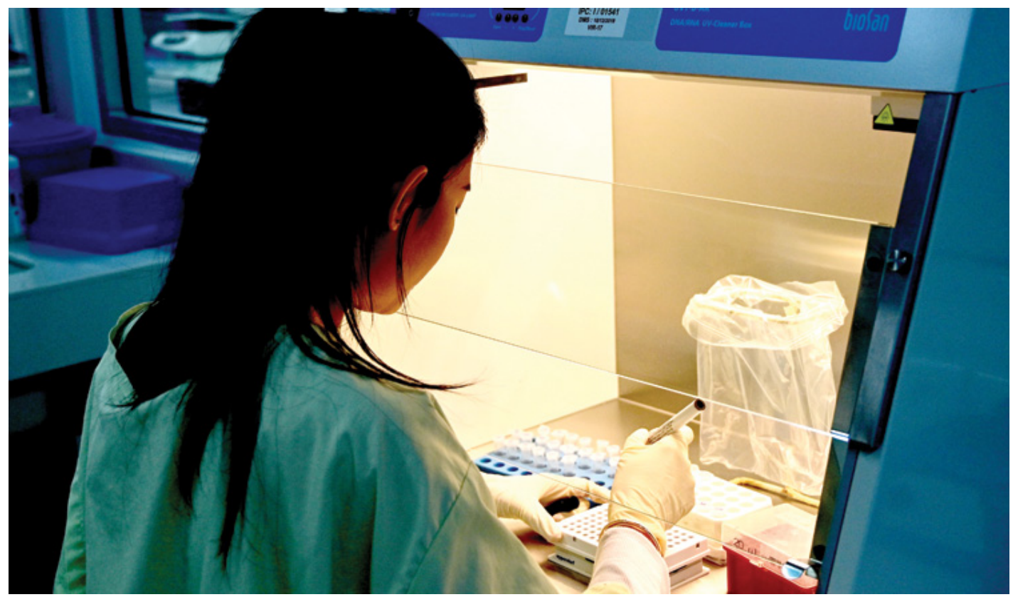
A lab technician conducting a viral test at Institut Pasteur du Cambodge (IPC).

SINCE the beginning of the COVID-19 pandemic Institut Pasteur du Cambodge, in collaboration with the National Institute of Public Health (NIPH), has been leading efforts to diagnose and identify cases of COVID-19 in Cambodia by analysing existing samples from patients with symptoms of Influenza-Like Illness (ILI) and Severe Acute Respiratory Infection (SARI).